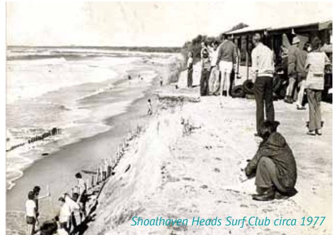
Shoalhaven Heads Surf Club circa 1977