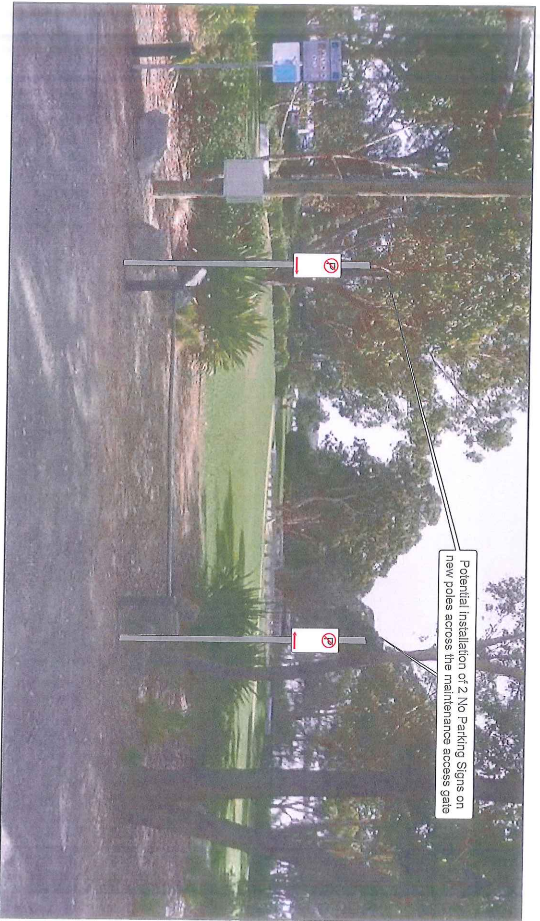
Potential installation of No Parking signage Bowen Street, Huskisson